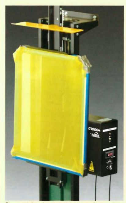
The new digital voltmeter supplied as standard on Vastex C-1000 Semi-Automatic Screen Coater

The rate at which the screen travels during the downward coating stroke can be adjusted according to emulsion viscosity, screen mesh and emulsion thickness to output as many as 50 screens/hour, each with three coats of emulsion.