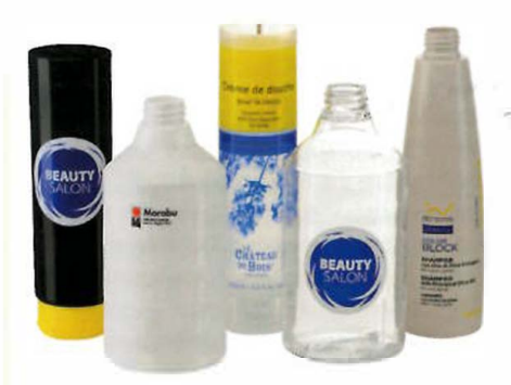
Marabu's new UV-curable screen-printing inks for personal care packaging

Highlights will also include new technologies, such as a combination of screen and digital printing. For digital applications, Marabu will be demonstrating the possibilities of liquid coatings and water-based inks for plastics.