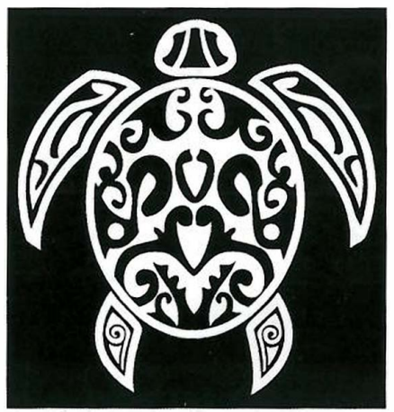
Axeon High Density White 1843 makes it easy to create interest and texture

This ink can be printed with manual as well as automatic presses and yields excellent washfastness on a variety of substrates, including cotton and cotton/poly blend fabrics.